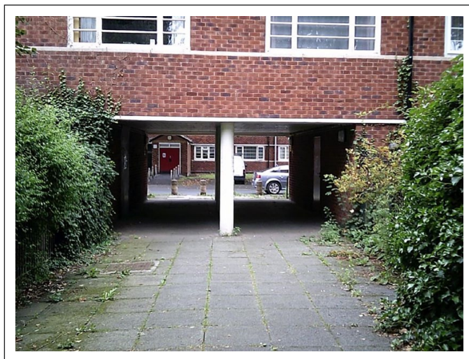
Figure 3. Passage where the Bentley Exchange occurs (resident's photo).

We were surprised to learn that the Bentley Exchange was once a constant presence, with ‘tables out all the time’. Currently, the resident’s photo of the empty passage is a more common sight, and the timing of the Exchange (‘the first full weekend of the month’) was an oft-repeated, almost jokingly so, reminder in TARA meetings. The interview, and photograph, helped clarify how and why the Exchange shifted to a monthly frequency. Interestingly, the photo shows a moment where any evidence of the Exchange is absent, suggesting this place retains meaning as a ‘focus point’ and a ‘set kind of thing’ even when materiality is absent.