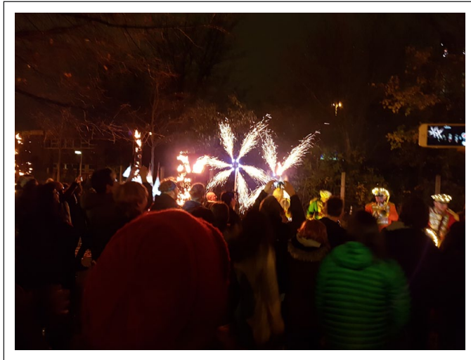
Figure 4. ‘Celebrate!’ finale performance on Hulme Street with band and fireworks.

estate. But together, these suggest how everyday organizing becomes ‘local’ as it is (re)made through practices, relations, and materialities to (re)construct the spatial extent of organizational phenomena as being on the Redbricks. In other words, the Redbricks as a named and material area – as here, not there – is organized by contrasting organizational activities to other (apparently) different scales of activity.